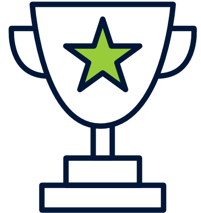
ISG Star of Excellence

Here is the email address: star@cx.isg-one.com